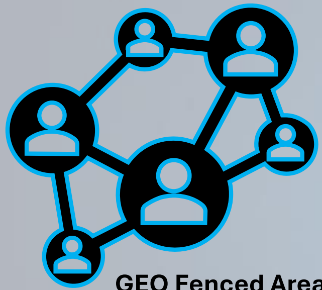
GEO Fenced Area